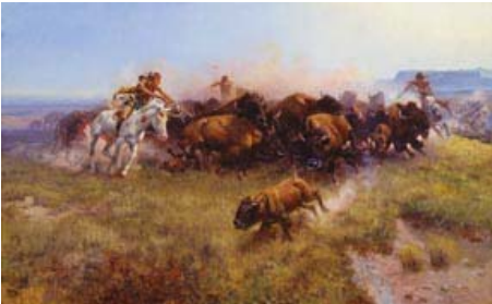
Buffalo Hunt [No. 39] , 1919. Oil on canvas. Amon Carter Museum, Fort Worth, Texas.