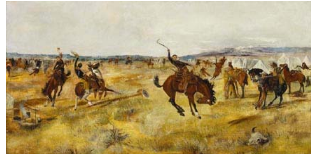
Breaking Camp , 1885. Oil on canvas. Amon Carter Museum, Fort Worth, Texas.