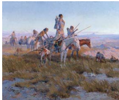
In the Wake of the Buffalo Runners , 1911. Oil on canvas. Private collection.