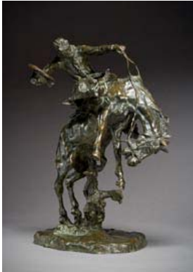
A Bronc Twister (The Weaver) , 1911. Bronze. Petrie Collection, Denver, Colo.