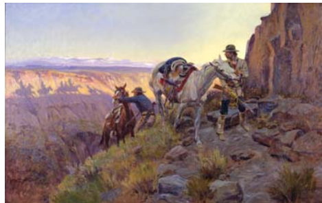
When Shadows Hint Death , 1915. Oil on canvas. The Duquesne Club, Pittsburgh, Pa.