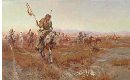
The Medicine Man , 1908. Oil on canvas. Amon Carter Museum, Fort Worth, Texas.