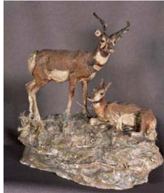
Ah Wah Cous (Antelope) , 1911. Wax, plaster, paint. Courtesy of the C.M. Russell Museum, Great Falls, Mont., and gift of Fred Renner.