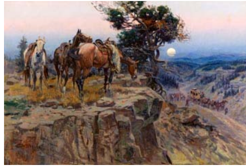
Innocent Allies , 1913. Oil on canvas. Gilcrease Museum, Tulsa, Okla.