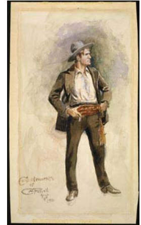
Self Portrait , 1900. Watercolor on paper. Buffalo Bill Historical Center, Cody, Wyo.