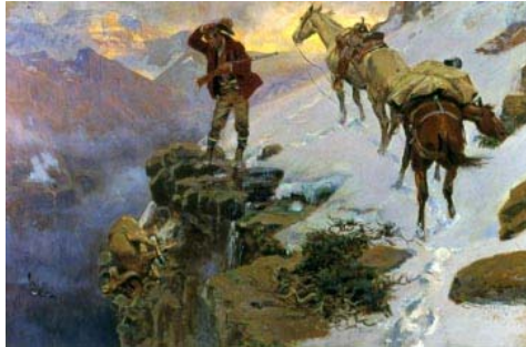
Meat's Not Meat Till It's in the Pan , 1915. Oil on canvas, mounted on masonite. Gilcrease Museum, Tulsa, Okla.