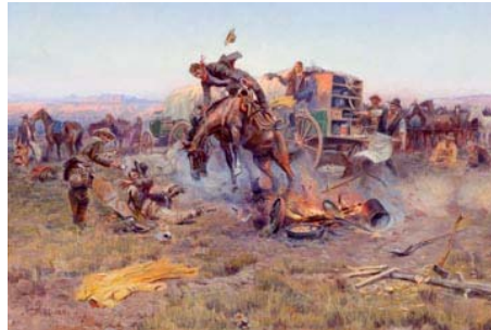
The Camp Cook's Troubles , 1912. Oil on canvas. Gilcrease Museum, Tulsa, Okla.