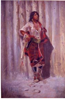
Indian Maid at Stockade , 1892. Oil on canvas. JP Morgan Chase Art Collection.