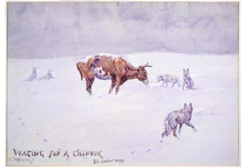
Last of Five Thousand (Waiting for a Chinook) , 1903. Watercolor on paper. Buffalo Bill Historical Center, Cody, Wyo.