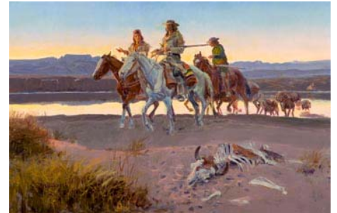
Carson's Men , 1913. Oil on canvas. Gilcrease Museum, Tulsa, Okla.