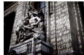
L to R: Manifesto , 2005. Arndt & Partner, Berlin. Proclamación Solemne , 2008. Le Fresnoy – Studio National Des Arts Contemporains & Le ministère de la culture et de la Communications, France.